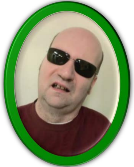
December 26 th Donald