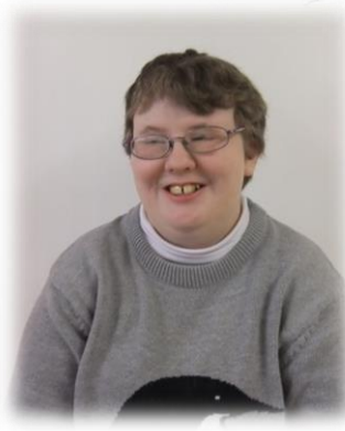
July 3 er June O.