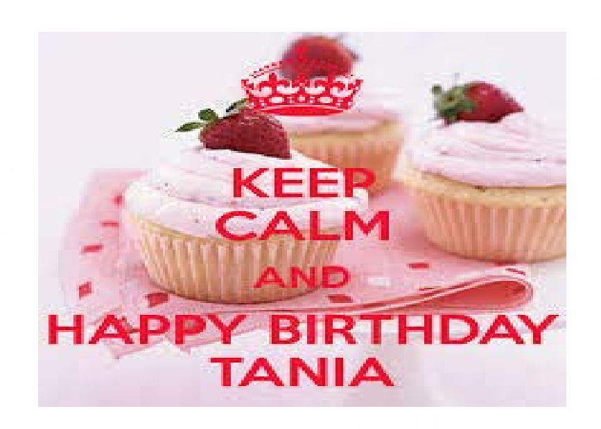
March 14, 2016