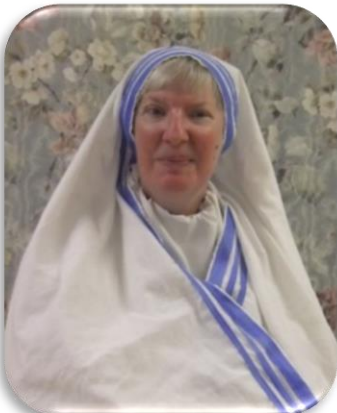
Mother Teresa

Mother Teresa was a missionary who served in Calcutta, India, and left her teaching job to work with the poorest of the poor people in the slums. She started out with no money and no help, but volunteers started to pitch in and slowly she began to gain funding through donations. Years later, she started her own order called the Society of Missionaries, which has since spread all over the world to help the poor and provide relief work in many different countries.