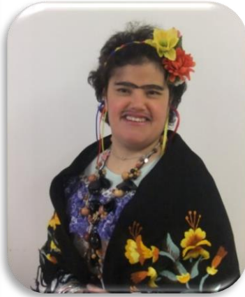
Frida

Frida Kahlo was a Mexican artist who painted many portraits, especially self-portraits , as well as works inspired by the nature and artifacts of Mexico. Her paintings are known for their brilliant colors as well as their vivid, emotional and personal nature. She has sometimes been called the mother of the modern-day "selfie" picture.