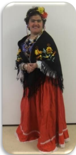
Frida picture by Nik