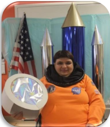
Astronaut picture by Ben

Cleopatra: Cleopatra reigned as queen of Egypt during the 1st century B.C. and is one of the most famous female rulers in history. She is known for building up the Egyptian economy through establishing trade with many Arab nations. She was a popular ruler among the Egyptian people because she embraced the Egyptian culture and because the country was prosperous during her rule.