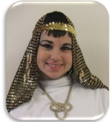
Cleopatra - picture by Ben M

Cleopatra: Cleopatra reigned as queen of Egypt during the 1st century B.C. and is one of the most famous female rulers in history. She is known for building up the Egyptian economy through establishing trade with many Arab nations. She was a popular ruler among the Egyptian people because she embraced the Egyptian culture and because the country was prosperous during her rule.