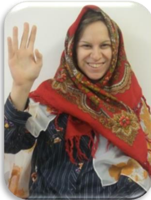
Malala

Malala Yousafzai is a present-day activist for the education of girls and women. She survived an assassination attempt by the Taliban as a teenager for publicly advocating education for girls. After she recovered, she continued to speak out on the importance of education. She won the Nobel Peace Prize in 2014.