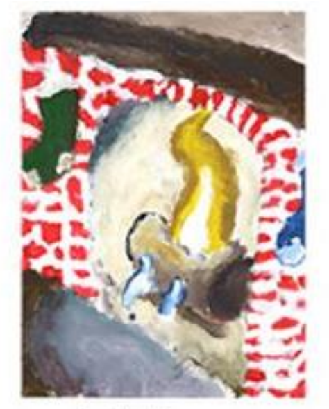
Inside Message: Wishing you a beautiful Holiday wrapped in warmth touched with wonder and filled with love

Inside Message: Sharing the joy of the holiday season.