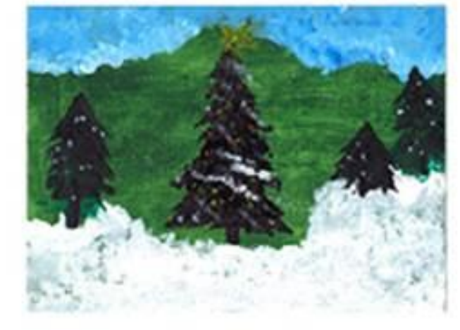
Inside Message: Sharing the joy of the holiday season.