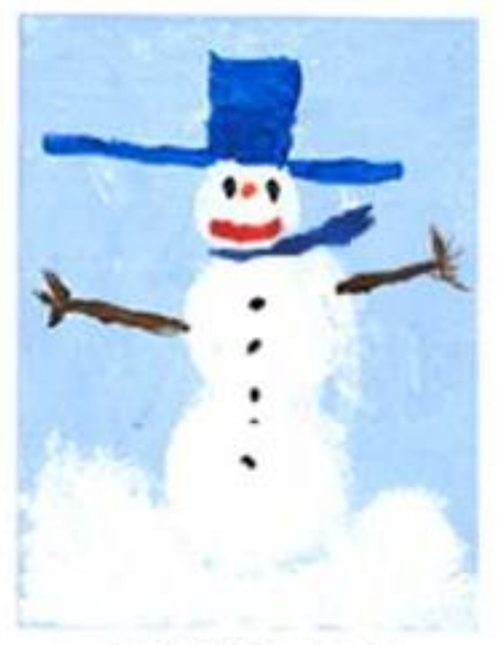
Inside Message: Have A Joyful Holiday Season!